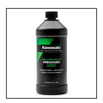
PREWASH - ON AND OFF ROAD

* MM is an engine hour meter specifically designed for use in the harsh environment of motocross racing As such, it will operate reliably in a number of other applications * - Motorcycles - MM has been specifically designed for motocross racing * It is also useful for tarmac race bikes, ATVs, enduro bikes, karts etc * Note: MM will operate on the new generation "pencil coil" ignitions * Marine - MM is fully spec'd for saltwater marine use * Applications include outboard motors, jet skis and other recreational and race craft * MM has a dual purpose input circuit * This means that the red sense wire can be cable tied along a sparkplug HT lead (Inductive Connection) OR it can be connected directly into a voltage supply (Direct Connection)